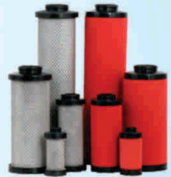
LINE FILTER ELEMENTS