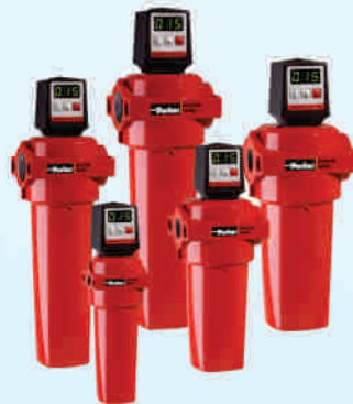
COMPLETE LINE FILTERS